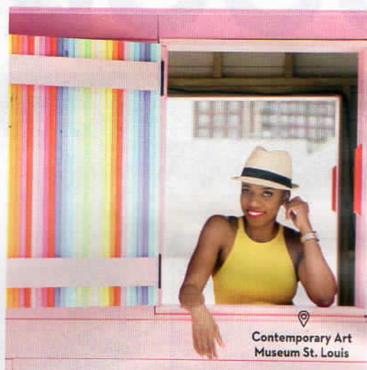
Contemporary Art Museum St. Louis