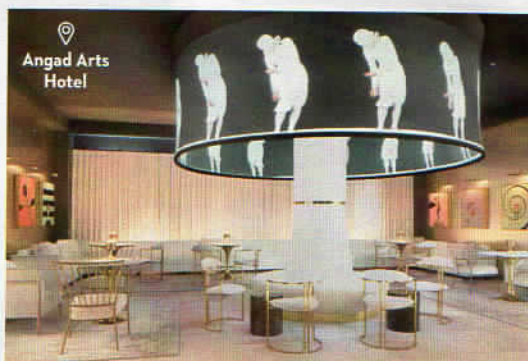
Angad Arts Hotel