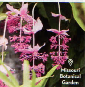
Missouri Botanical Garden